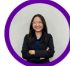
Hengly Te Cambodia