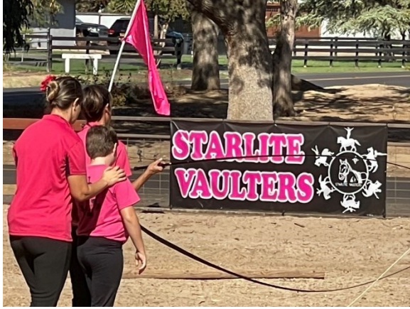
Gamma Starlite Vaulters is a local organization that teaches kids how to vault.