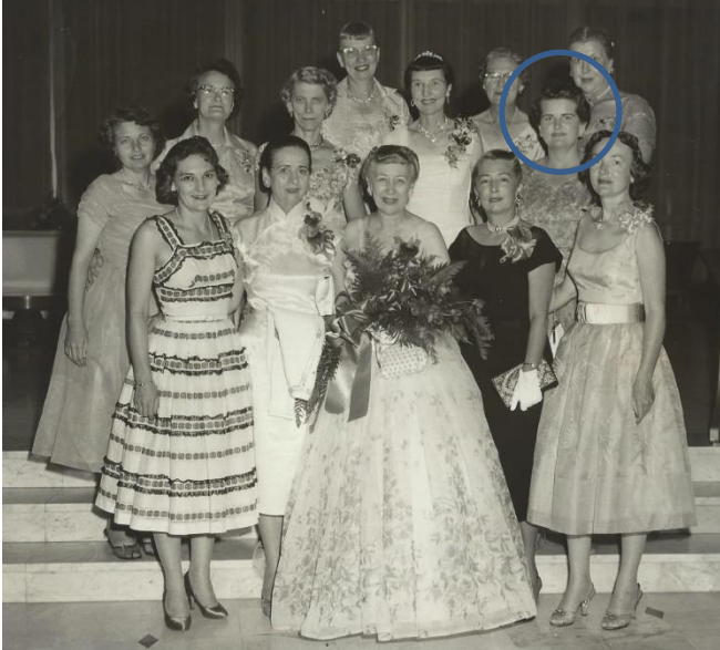
International Convention 1959 Florida