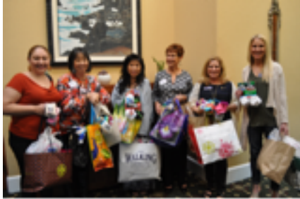
Altruistic Socks Collection