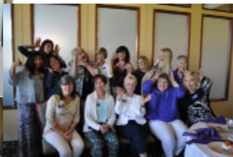
Beta Omicron - The Serious Bunch