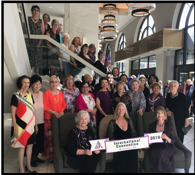
The California Delegation