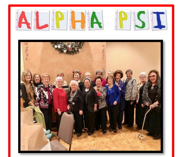
Alpha Psi chapter sisters pose at their holiday dinner in December 2018. Happy New Year to all!!!