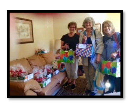
Beta Pi sells one pound bags of nuts each year. The proceeds support altruism and scholarship.

Nuts were a successful fundraiser for three of our chapters.