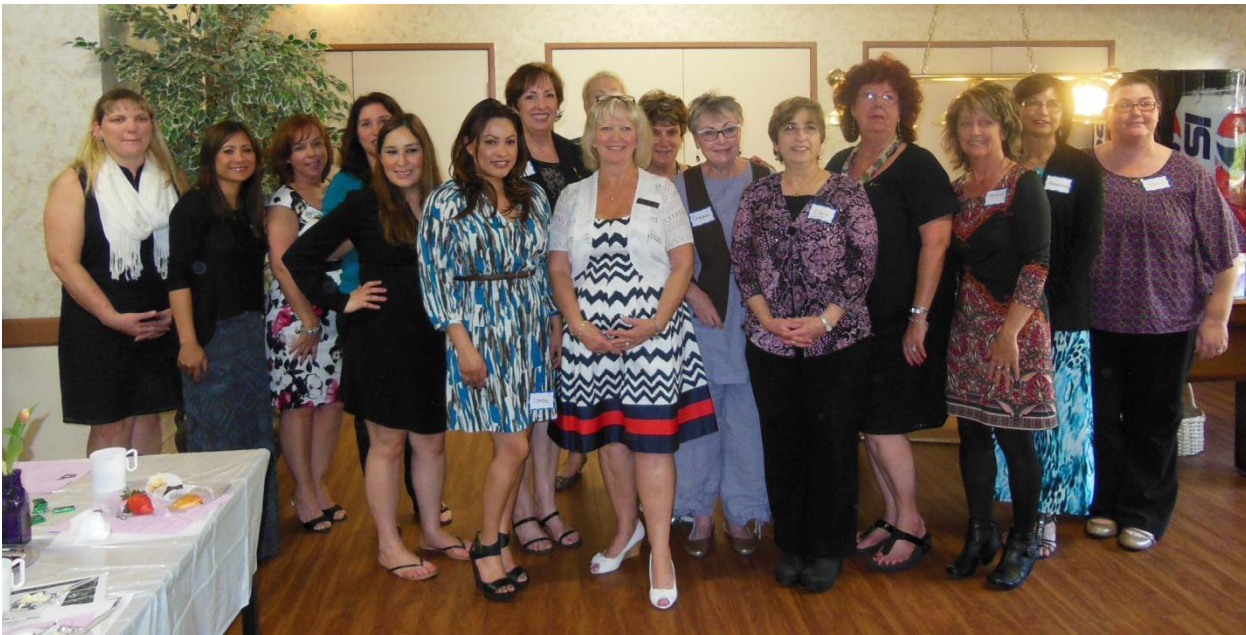
California Gamma Tau Charter Members March 16th, 2013

Today California Alpha Delta Kappa is comprised of 53 chapters and approximately 1300 members. Our newest chapter, Gamma Tau, was just chartered March 16th, 2013, in Fullerton, California.